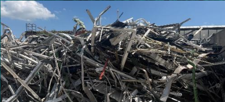
Max. 10% by weight of foreign substances*